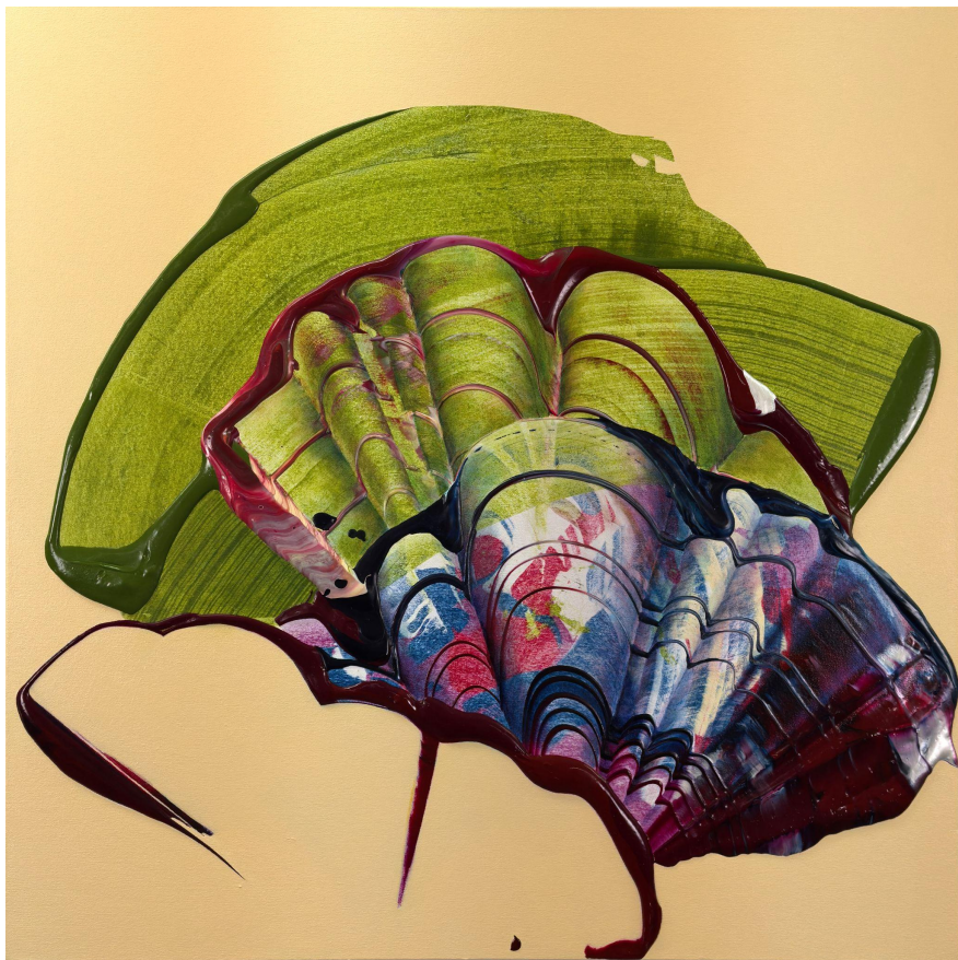
Funk Ninja , 2026. Acrylic on Canvas, 30" x 30"