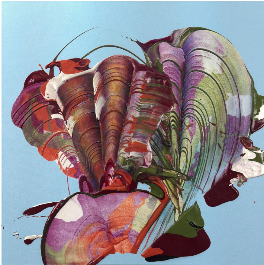
Just The Two Of Us , 2025. Acrylic on Canvas, 30" x 30"