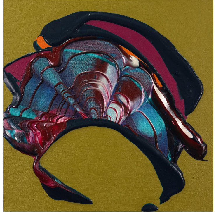
We Are One , 2026. Acrylic on Canvas, 18" x 18"