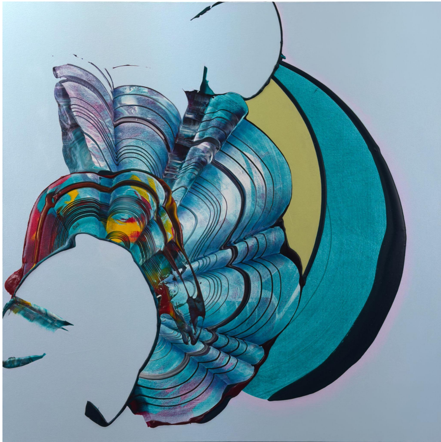
Mr. Blue , 2026. Acrylic on Canvas, 48" x 48"