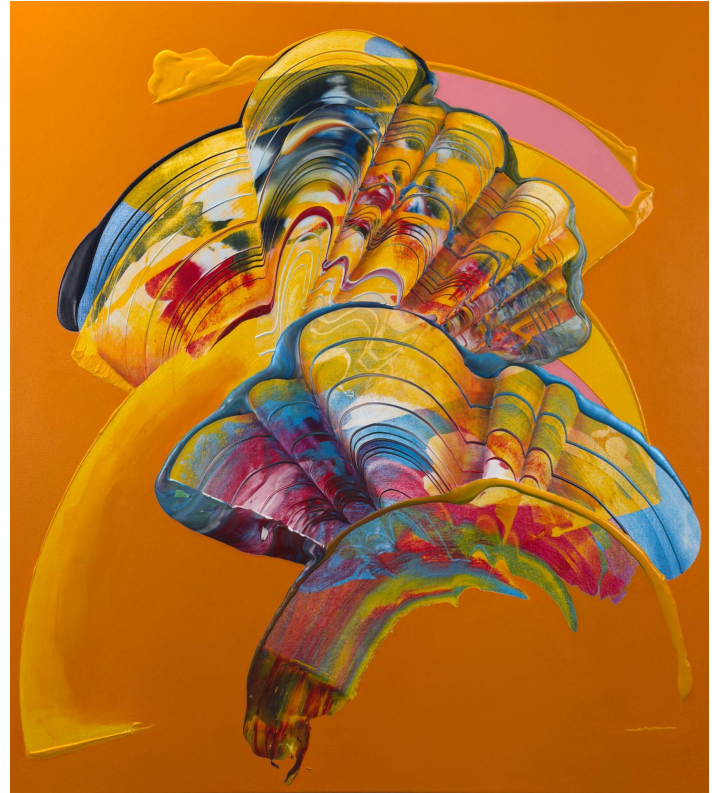
Oh! You Pretty Things , 2026. Acrylic on Canvas, 52" x 46"

Ultimately, Chroma | Pop stands as a triumphant celebration of paint, intense colour relationships, and the visceral power of the medium.