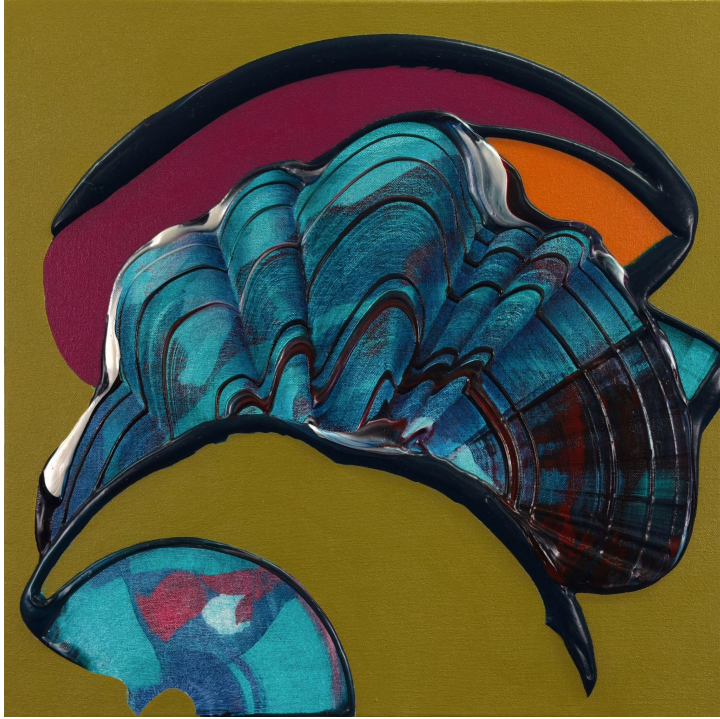
We Are Not Two , 2026. Acrylic on Canvas, 18" x 18"