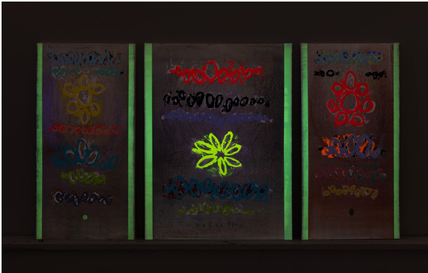
Free From / Future Play / Striking Senses TRIO, 2026. Acrylic on Canvas, 48" x 84" (Under UV light)