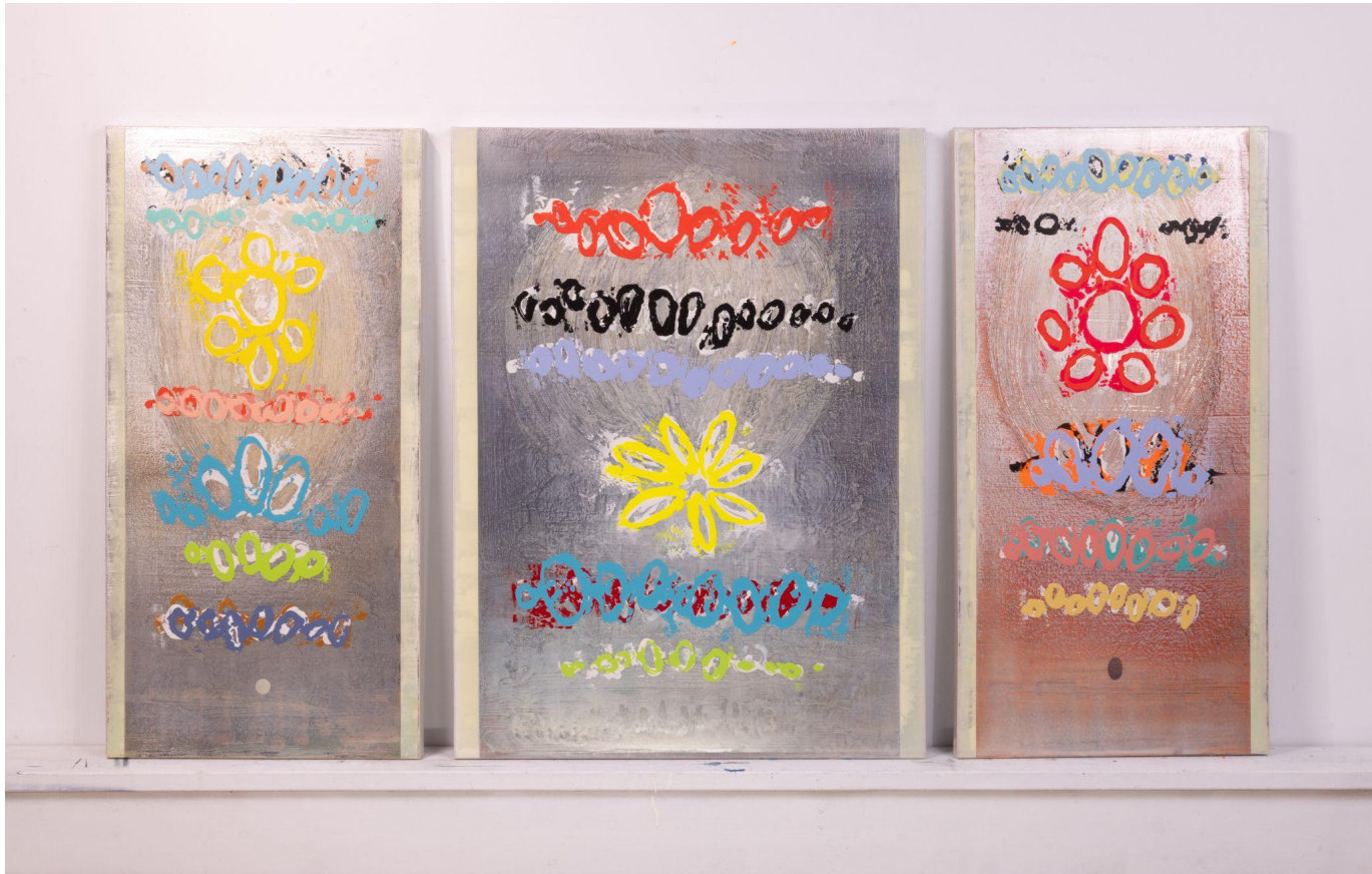
Free From / Future Play / Striking Senses TRIO, 2026. Acrylic on Canvas, 48" x 84"