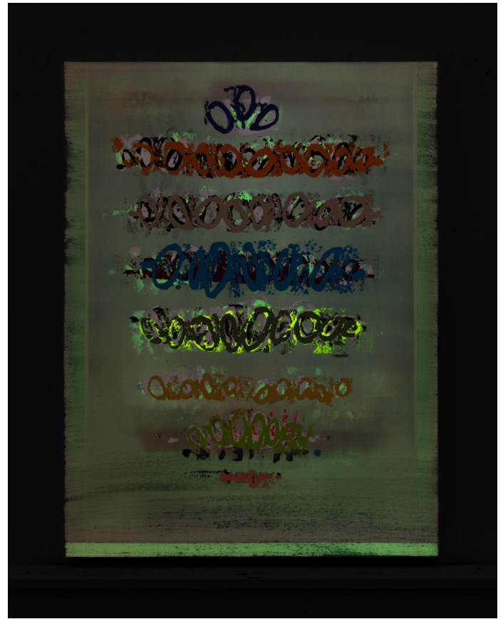
In Translation, 2026. Acrylic and Crayon on Canvas, 66" x 50" (Right photo: Under UV light)